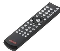
Product code: TR-67

If you are changing the settings of the detection sensitivity (eye logo) or the sensitivity of the twilight switch (sun logo), You can enter a value for example 5 and the RGB LED will communicate this back to you in 5 flashes. If you select 3 it will flash 3 times. It will do this in the colour of that function. You can change this as much as you want. Only when you select OK it will save the last selected setting. When you select C (for cancel) it will change nothing and will exit.